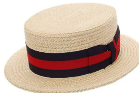
Optional Boater Hat