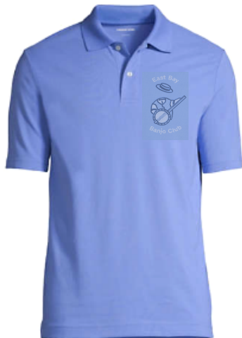
Blue Polo Shirt